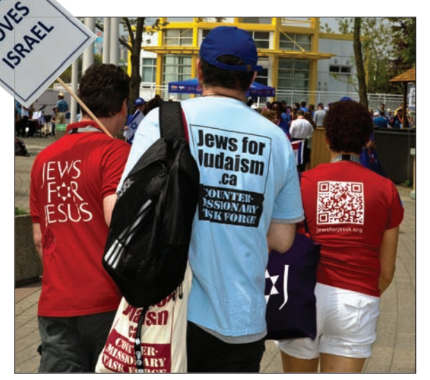
Jews for Judaism volunteer shadows Jews for Jesus missionaries on the Annual UJA Walk With Israel in Toronto