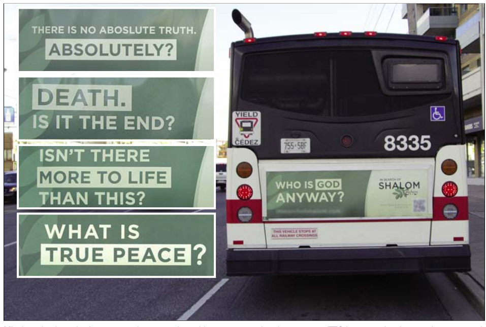
Missionaries launched an aggressive campaign with numerous advertisements on TTC buses and a door-to-door postcard mailing throughout Jewish neighbourhoods in Toronto.

When people respond to these advertisements by phone, instant messaging or text, they are immediately connected to a missionary specifically trained to make the case for Christianity to a Jewish audience. Without a doubt, these highly skilled individuals insist that faith in Jesus is entirely consistent with the teachings of Jewish