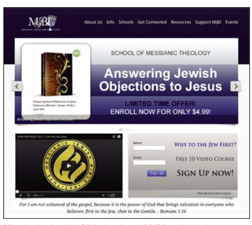
Messianic Jewish Bible Institute (MJBI) website homepage.

serious issue, when the church was imbued with the power of the state." However, this historical situation is a red herring and not the real concern of the Jewish community. Even if the church's efforts to convert us came with a smile and welcoming hand – rather than a threatening sword and fist – we would still not be receptive to their proselytizing efforts. Why not?