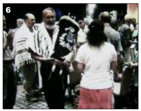
2, 3, 5 & 6: You I u