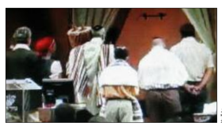
Members sing Ki Mitzion as they remove a Torah from the Aron HaKodesh at Baruch HaShem Messianic Synagogue, San Antonio, TX

Even though Messianic doctrine claims to descend from first century Jewish Christians,