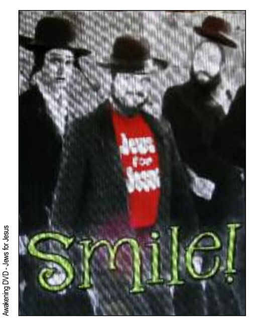
Recent Jews for Jesus promotional image

they seem to have no qualms about appropriating Jewish works that are based on the Oral Torah and were written over 1,000 years later.