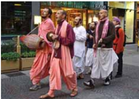
Cults are still prevalent worldwide, but members may not dress so provocatively today as they did in the 60's.

1. Jews are the target of choice of missionaries and various cult groups on almost every college and university campus in North America and Israel.