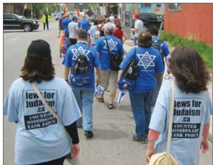
Some of the missionaries that Jews for Judaism staff and volunteers “shadowed”.